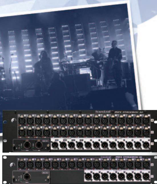
The 3U Mini Stagebox 32 and 2U Mini Stagebox 16 come with interface cards included.